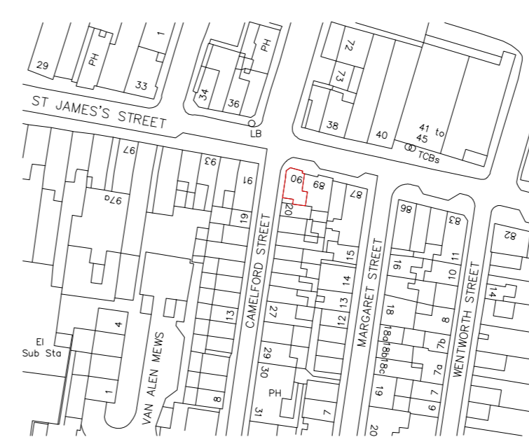
Location plan (Ground Level) 1:1250