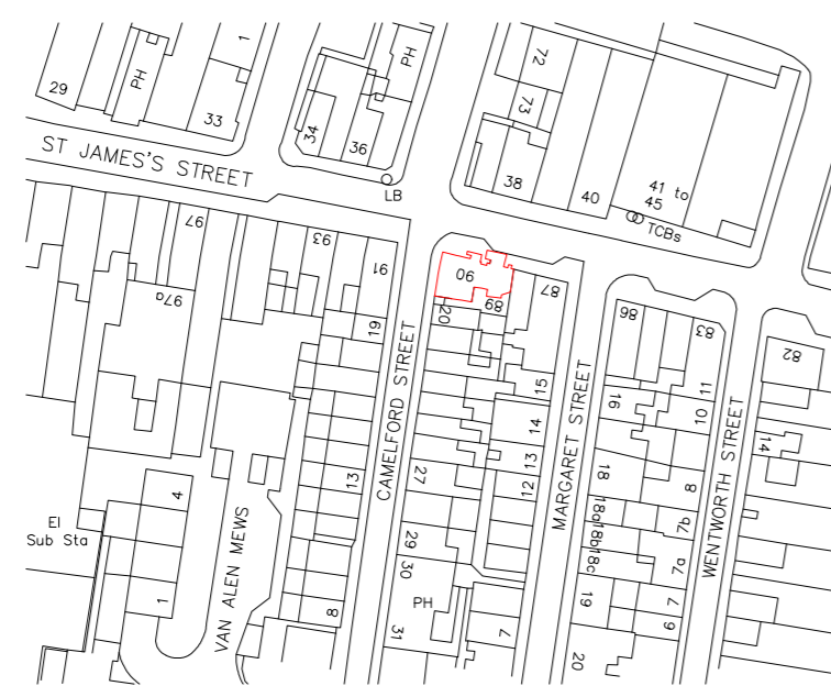
Location plan (Basement Level) 1:1250